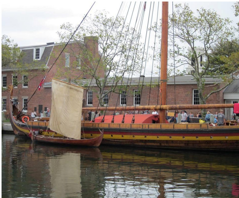
Draken Harald Hårfagre is a clinker-built Viking longship, at Mystic Seaport.

Instead of voting at a meeting, we will be doing an online ballot for the Office of Seneschal. The above link will become available for voting on October 17, 2016. Only those paid members who are 14 or older, and who reside within the geographical boundaries of the barony, are eligible to vote. ALL BALLOTS ARE DUE BY 10:00 PM, OCTOBER 31, 2016. Please exercise your right to vote!