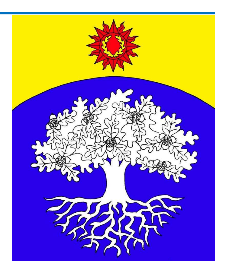
Jane Brezzo 146 Prospect Street Glastonbury, CT 06033